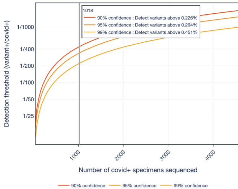
Figure: Screenshots of calculator 1 for sequence sample size to detect novel variants (top), and calculator 2 for the speed of variant detection with a fixed number of sequences (bottom).

How early can an emerging variant be detected with a given sample size?